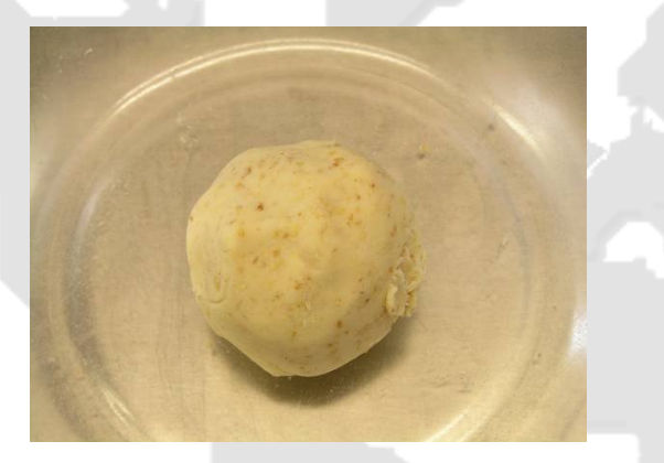
Fig 3: Fully mixed diet