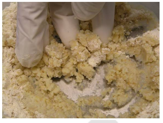
Fig 2: Mixing of stonefly diet and solutions