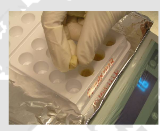
Fig 4: Adding diet to individual wells